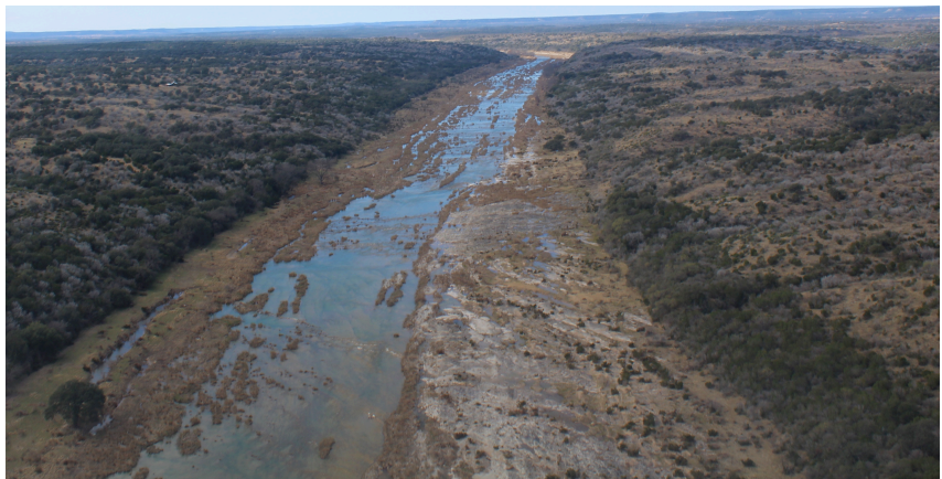
Llano River upstream of White's Crossing, Mason County

The Alliance wrote a follow-up letter to TxDot regarding their recent presentation on the proposed White's Crossing Bridge. The new bridge is to be 15 feet in height and the old bridge will be removed. Many residents and river users raised concerns regarding the loss of river access once the new bridge is completed.