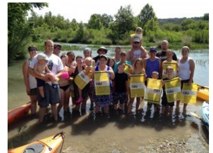
Participants of the South Llano River cleanup show off their Up2U trash bags that they filled during the June 29th cleanup event.

For more information on the South Llano Paddling Trail, visit: http://www.tpwd.state.tx.us/fishboat/boat/paddlingtrails/inland/southllano/ .