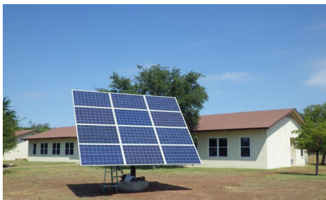
A set of solar panels track the movement of the sun for optimal energy production. Installation of solar panels at LRFS were made possible through the Innovative Energy Demonstration Grant from the Office of the Texas Comptroller.

The Llano River Field Station (LRFS) received an Innovative Energy Demonstration Grant for $230,000 from the Office of the Texas Comptroller. The energy demonstration grant funds will be used to install roof mounted solar photovoltaic panels on two buildings and a wind turbine at LRFS. The grant was awarded based on the location (abundant sun and wind) of LRFS and other criteria: a ready-to-go project; education and outreach value; and size, type, and cost per kilowatt hour (kWh) of the technology. The capacity of the solar system will have an estimated annual equivalent production of 59,510