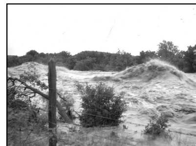
Flooding on the North Llano River, July 22, 1938 – peak discharge, 47,000 cubic feet per second.

To view the river flow in the Upper Llano, visit: http://waterdata.usgs.gov/nwis .