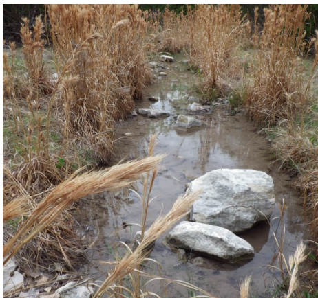
Spring near the North Llano River with healthy Bushy Bluestem riparian vegetation.

The initial writing of the WPP began with a review of historic water quality, quantity, and biological (macroinvertebrate, fish, and habitat assessment) data in the Upper Llano Watershed. The report was approved by the Texas State Soil and Water Conservation Board, and is available for public viewing at: www.southllano.org . The Watershed Protection Plan continues to progress as the Working Groups identify and refine the issues of the Upper Llano Watershed.