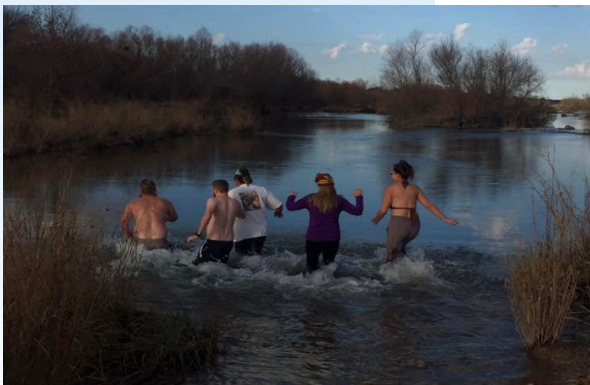
The folks at Castell General Store shared a picture of the hardy participants of their 8 th annual Polar Bear Plunge.