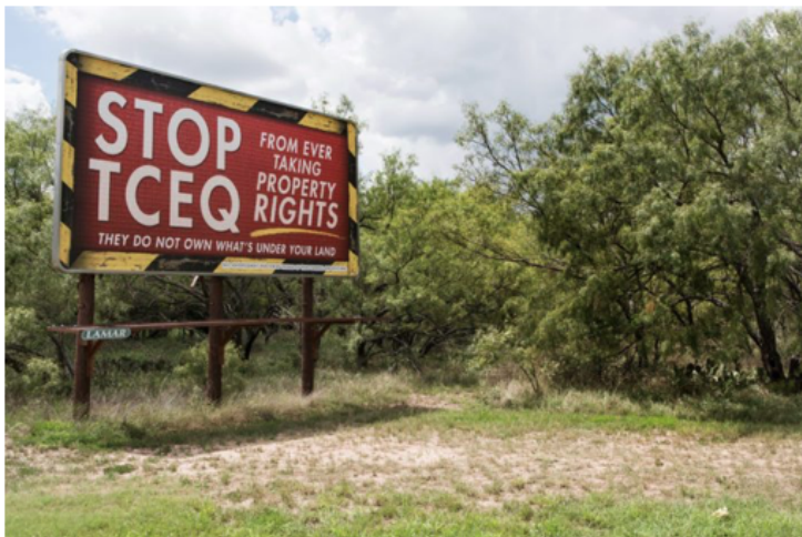
A sign on the outskirts of Menard protesting TCEQ's involvement in water rights.