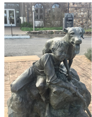
Old Yeller Statue commemorating Llano River resident author Fred Gipson.