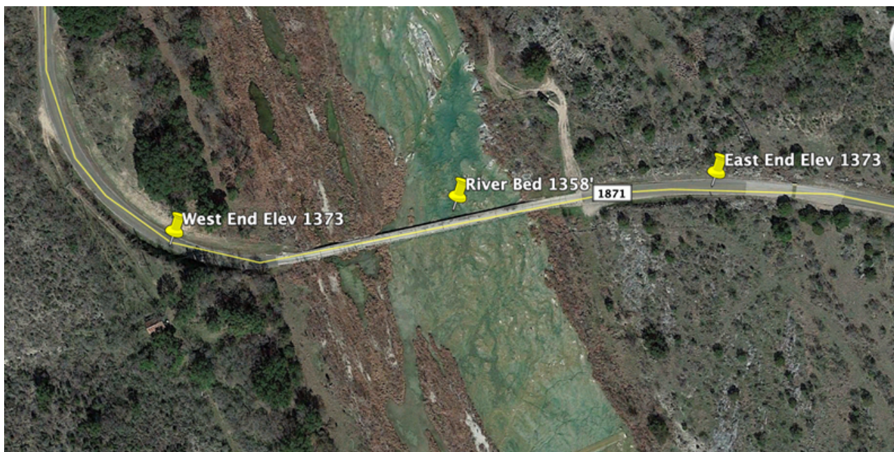
Google Earth image showing approximate location of 15 foot bridge at White's Crossing. The new bridge is to be located just downstream of the old bridge. Prepared by LRWA.