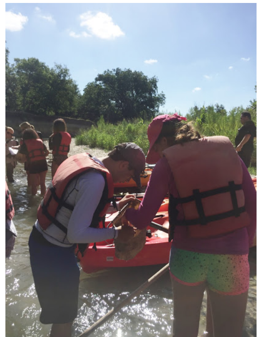
By learning what macroinvertebrates are found in a river like the South Llano, students are able to ascertain the health of a river.