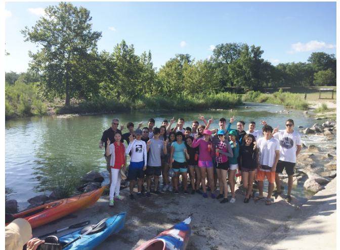
Students from Brazil ready for a kayak trip down the South Llano.