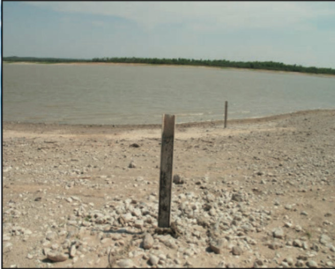
Twin Buttes Reservoir south of San Angelo is still nowhere near capacity. It is currently estimated to be 12.2 percent full.

Details forthcoming in future newsletters.