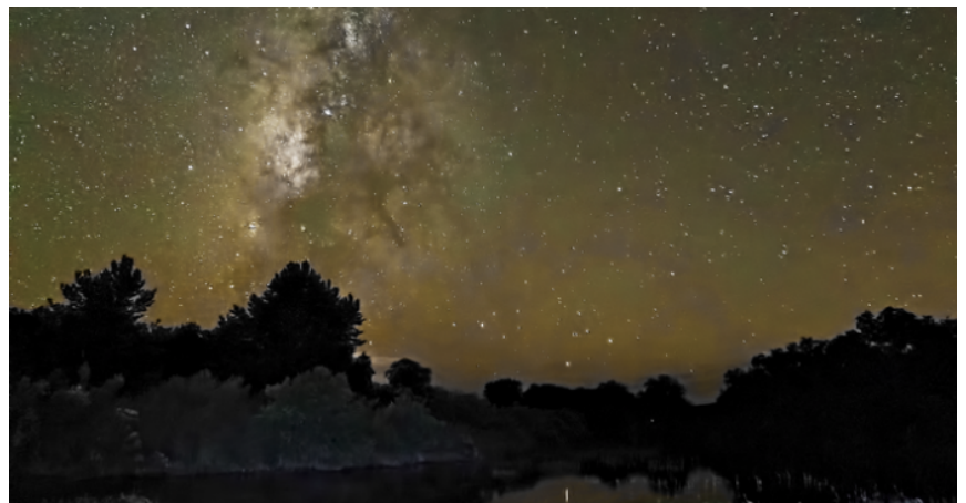
The Milky Way sets over South Llano River State Park in Texas, U.S.

Nestled just off Interstate 10 on the western edge of the Texas Hill Country is the International Dark-Sky Association's newest appointee – South Llano River State Park , located just outside of the city of Junction. The International Dark Sky Park designation will ensure the protection of the park's dark skies not only for the park's natural resources, but also for the local community and out-of-town visitors to enjoy.