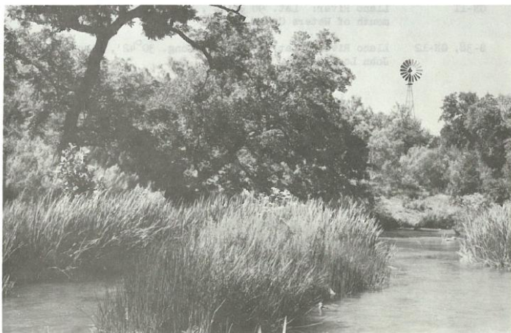
Station 3, first crossing of Highway 377 north of Telegraph.