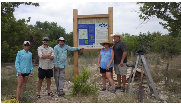
Mission Accomplished – well almost. Kiosk <u>roof to</u> be added once concrete sets.

A special thank you to South Llano River State Park for help installing the kiosk! Saved everyone a lot of digging.