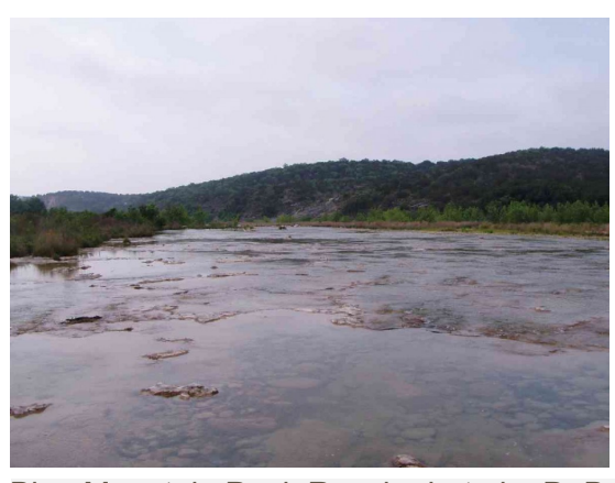
Blue Mountain Peak Ranch

Please RSVP to <a href="mailto:southllanoriver@gmail.com">southllanoriver@gmail.com</a>