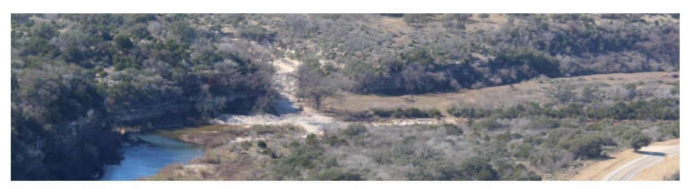
Headwaters of South Llano at Paint Rock Creek

"We are realistic enough the know that we cannot stop the transport of oil from the Permian Basin to South Texas, to the Houston area, or the coast. We know that. What we were attempting to do is what we might be able to affect, and that is to keep it away from this very sensitive area."