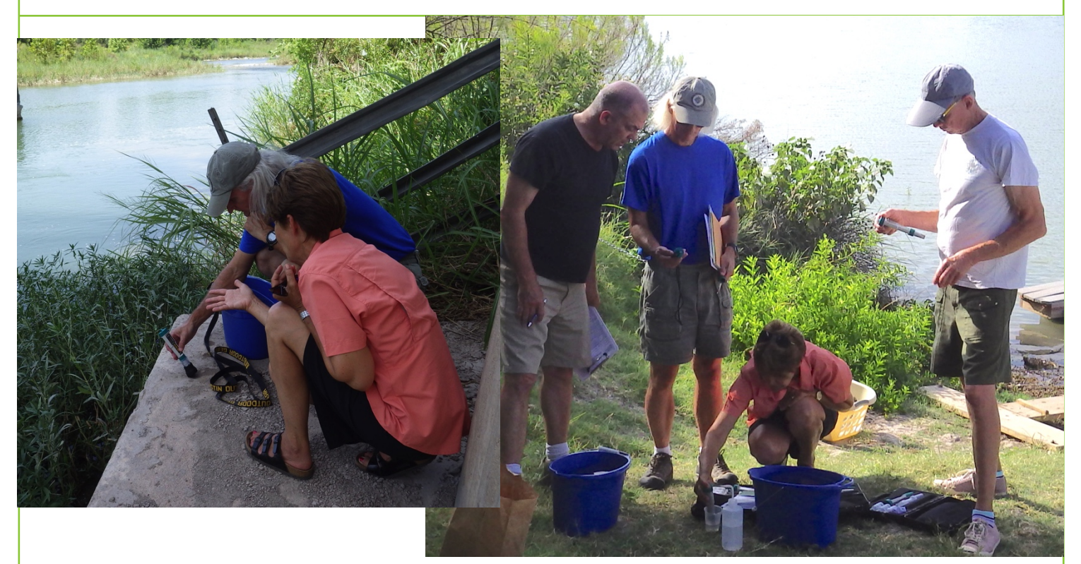
Mason County members of Texas Master Naturalist and the Llano River Watershed Alliance tested new water quality monitoring probes on the Llano this week. The probes were obtained through a generous grant from the Mason Community Foundation.

Check out Texas A&M AgriLife Extension's first edition of the Wild Pig Newsletter.