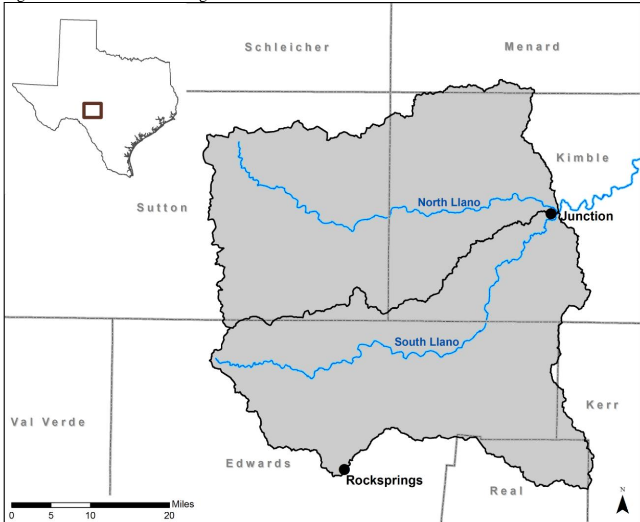
Figure A6.1. Watersheds targeted for LULC classification.

SSL will collaborate with project partners, local agencies and stakeholders to develop a comprehensive GIS inventory of the Upper Llano River watershed. This GIS inventory will include the most recent information available on land use, elevation, soils, stream networks, reservoirs, roads, public park lands, municipalities and satellite imagery or aerial photography. Locations of SWQM stations, United States Geological Survey (USGS) gages, public access points to the waterbodies, floodwater-retarding structures, wetlands, known OSSFs, TPDES permittees (including WWTFs, CAFOs and MS4s), and subdivisions will also be included. Sites permitted for land application of sewage sludge and septage should be included. Information on