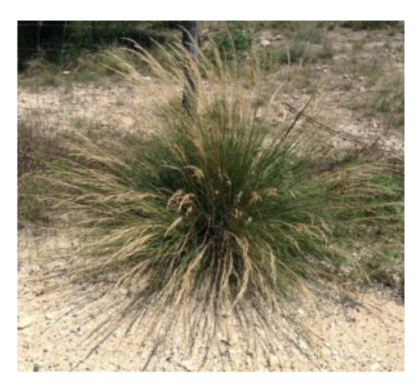
Mexican needlegrass.

Although the publication is free, one still has to fill out a billing form. This only takes a few minutes and helps all of us do our part to help the watershed.