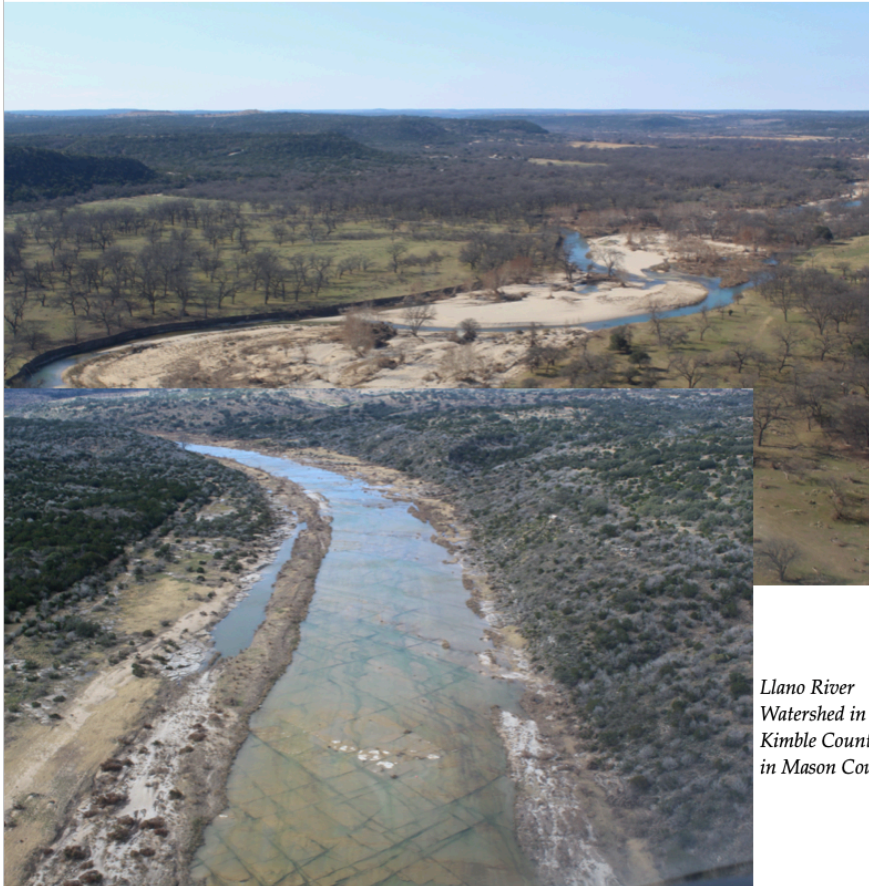
Llano River Watershed in Kimble County and in Mason County

Llano River Watershed Alliance - February 26, 2021