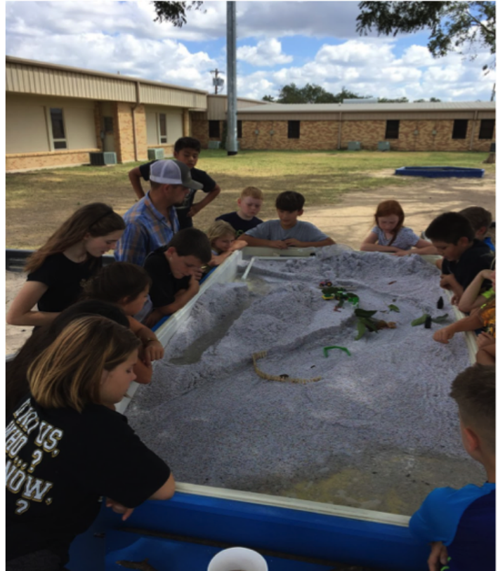
Junction ISD students learn about streambank erosion using Llano River Field Station's new Stream Trailer. Below: The Streambank Restoration Workshop provided hands-on training for participants.