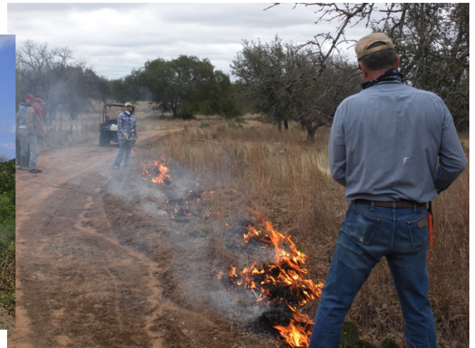
Over 6,700 acres in the Watershed were treated with Prescribed Burning in the first year. The annual goal is between 5,400 and 7,700 acres.