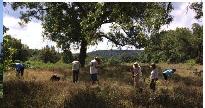
Volunteers dedicated an August weekend to removing Mexican Needlegrass, a new invasive species, at South Llano River State Park.