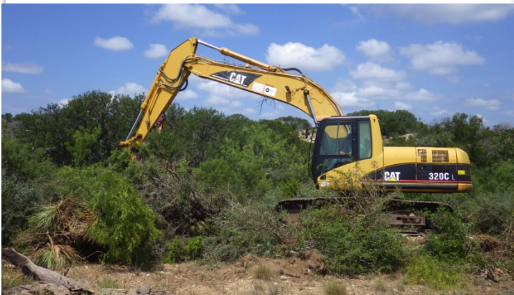
In the first year, over 13,000 acres of brush were treated in the Watershed. The annual goal in the WPP is 9,000 acres.

Implementation of Management Measures defined in the Upper Llano River Watershed Protection Plan (page 2) has gotten off to a good start in the first year. Thanks to partnerships with Natural Resources Conservation Service, local Soil and Water Conservation Districts, and local Prescribed Burn Associations, both the annual goal for brush control and prescribed burning were reached. And thanks to a partnership with Texas Parks and Wildlife Department and volunteer efforts from Hill Country Alliance, Texas Master Naturalist, and Llano River Watershed Alliance, significant strides in Riparian Restoration were made in the Watershed.