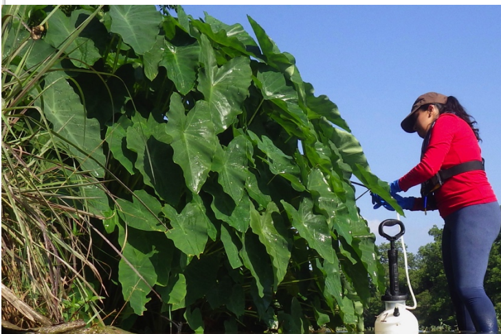
Elephant Ear were treated on 24 miles of riparian habitat along the Llano. The WPP goal is to improve vegetation conditions along 10% of the riparian zone lacking riparian buffer.