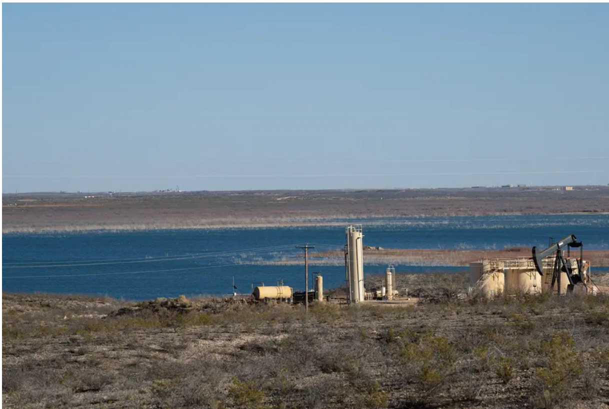
An oil drilling operation on the banks of the Red Bluff Reservoir on May 27, 2020.

Oil and gas producers recycle a small portion of produced water. Treating the water, which can be ten times saltier than seawater and is often laced with leftover fracking chemicals, has been uneconomical so far, especially compared with the low cost of injection disposal.