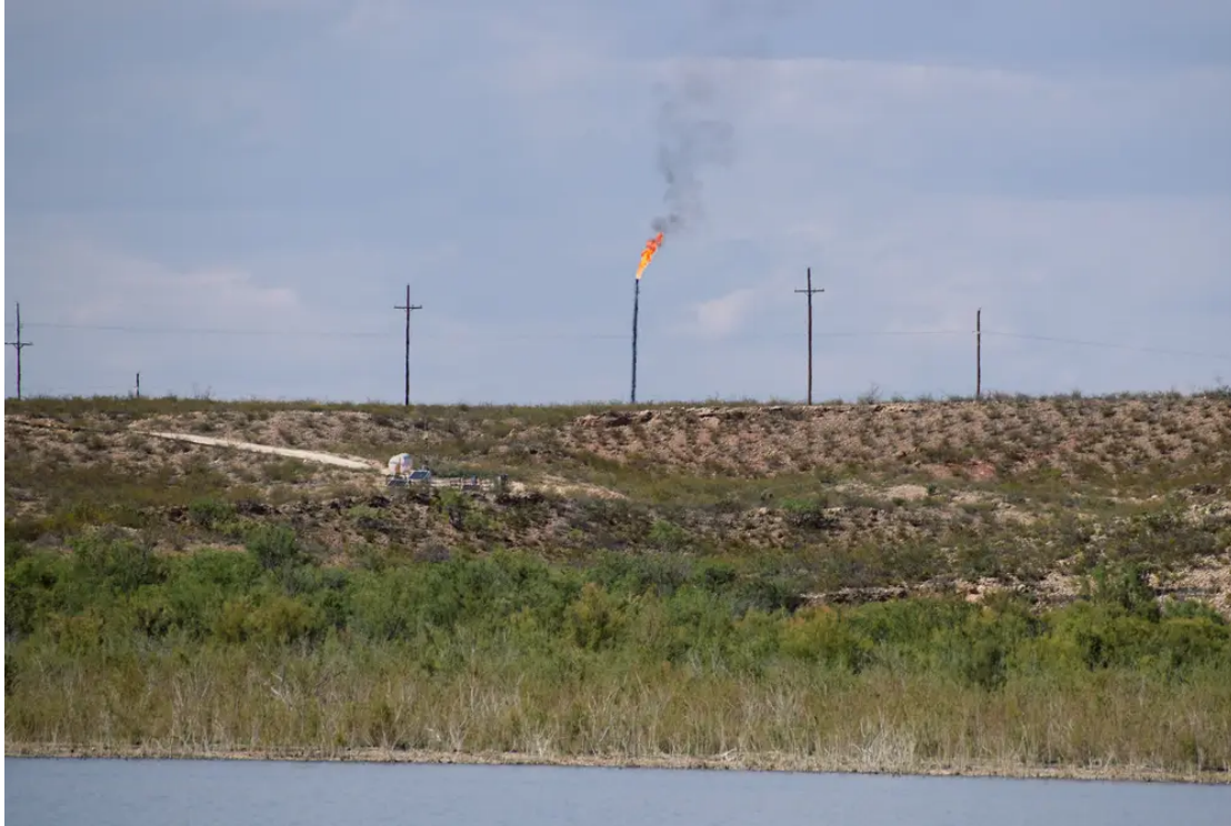
A methane gas flare burns four miles from Red Bluff Reservoir on Feb. 24, 2020.